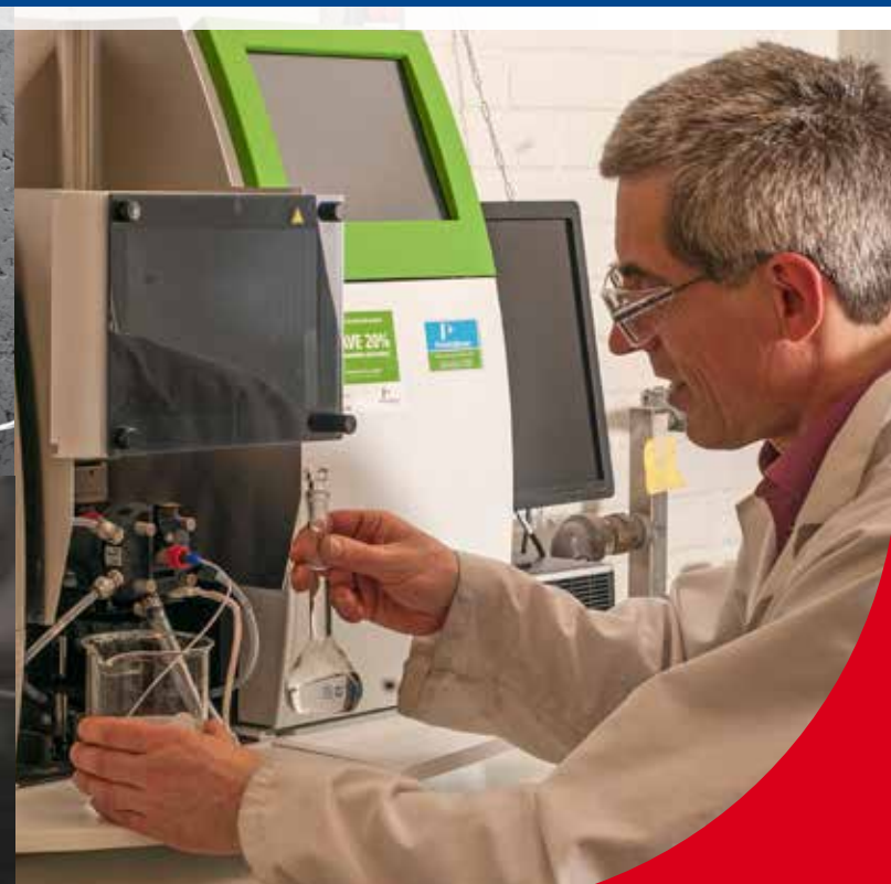
▼ Laboratory environments for testing and evaluation.